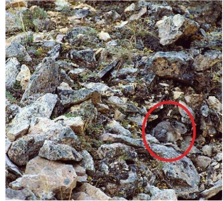
American Pika (rodent)