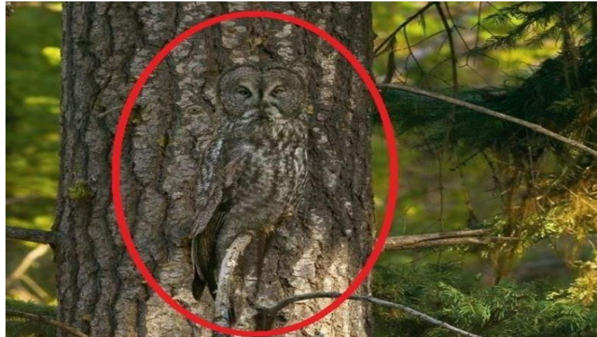
The Great Gray Owl