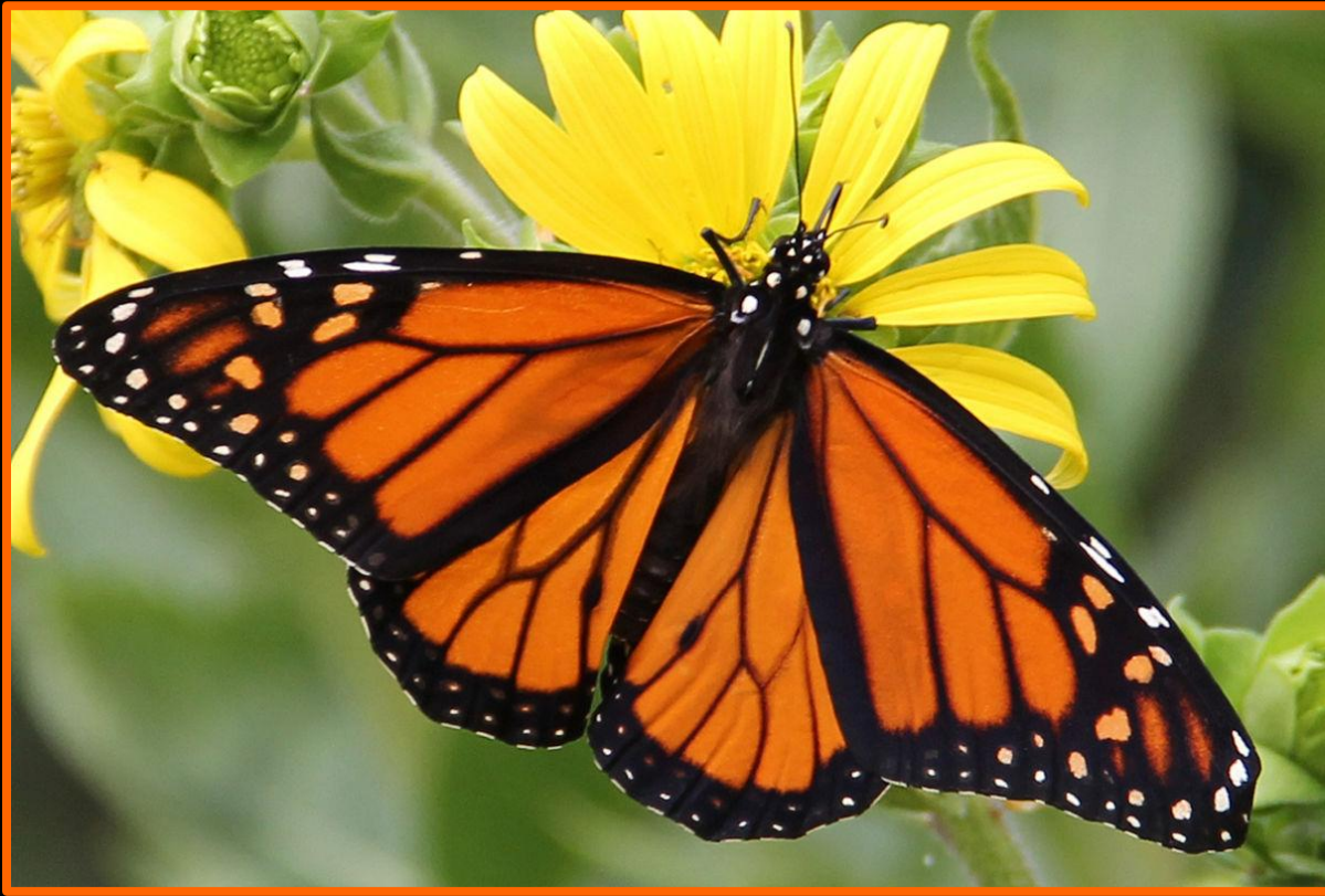
monarch ( Danaus plexippus ) [male]